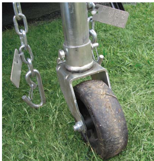
(left) Fold down faucet works well. Thermostat is designed so you can brush against the face without messing the setting. Toggle switches are easy to push. (right) Front trailer jack wheel is pinned in place securely, but easy to remove.

heater and deluxe faucet, 16,000 BTU furnace, dual propane tanks, and a high wind kit. I was pleasantly surprised to see many features I considered to be “optional” come standard in the Classic.