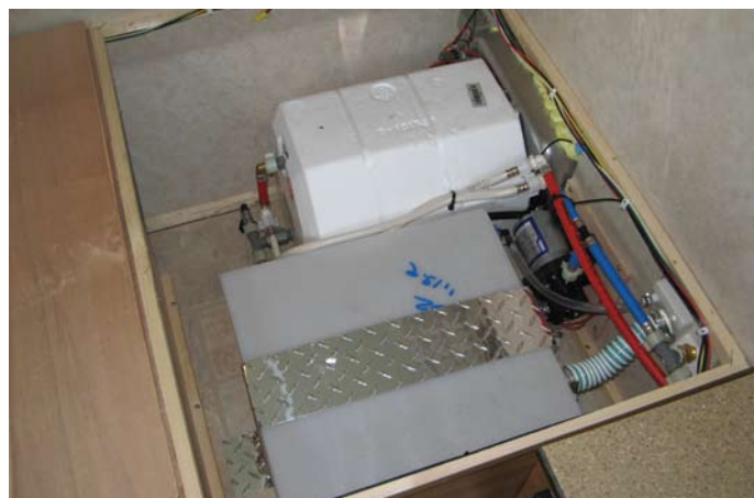
(top) Road ready. (middle) Back of refrigerator. The white tube is the drain for the drip pan. What a convenience! (bottom) Water heater, pump, and fresh water tank. Notice the black pipe elbow to the left of the water heater going down into the floor: This is the low point water drain for the entire system.

shipping. I found it interesting that air conditioners are most popular in the eastern U.S., while furnaces are more popular in the western U.S. The options on our model included the 3000 pound axle (off road) package, Fantastic fan, 6 gallon water